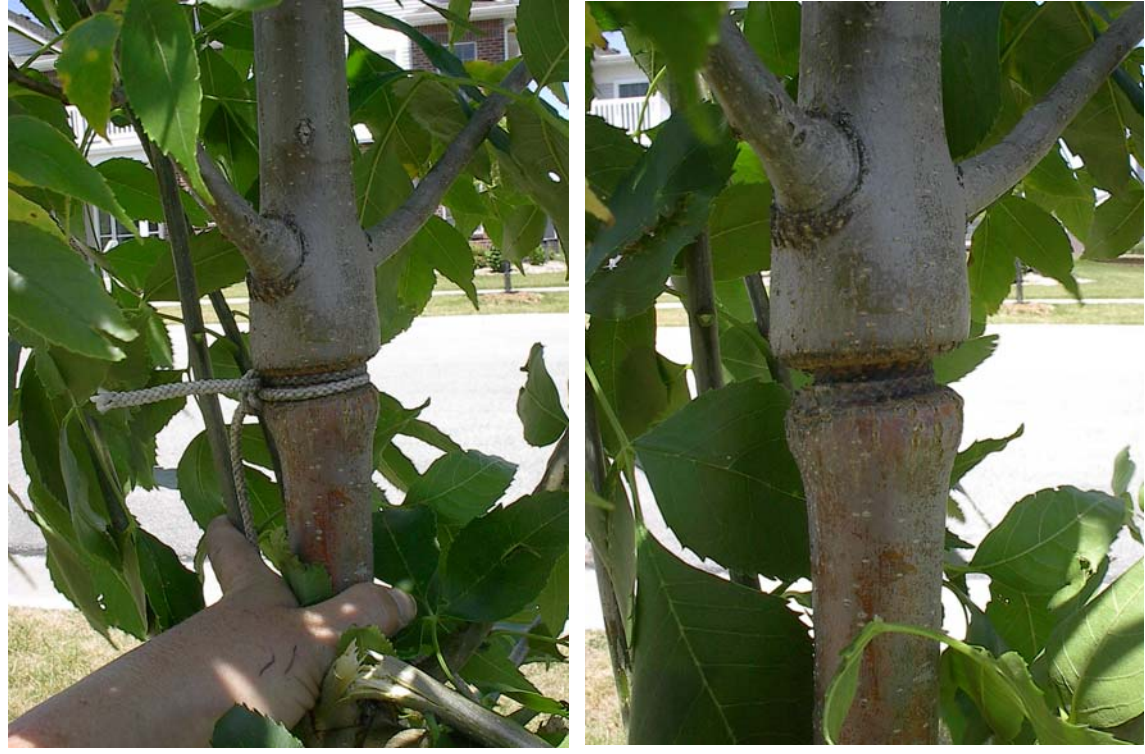
that insects can use to enter the trunk.

Stakes with ties and tree wraps left on the trees too long have caused injury to the Somerset trees in two ways. First the ties and wraps impair the growth of the trunk, some even strangle the tree. Second, the wraps rub the bark off the tree and cause a weak spot